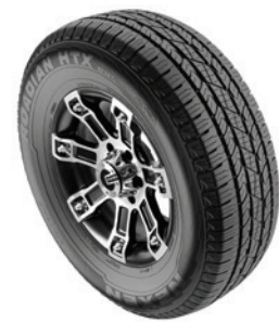
ROADIAN HTX RH5